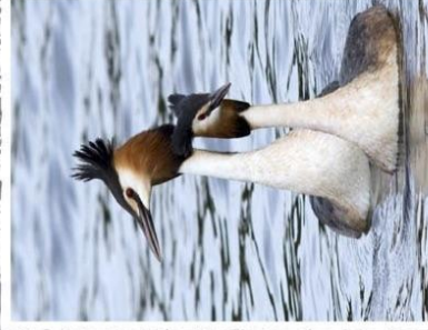
Great crested grebe